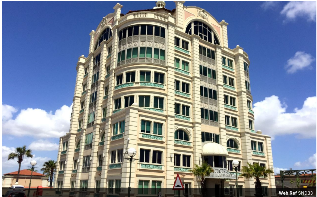
Web Ref SND33

Vineyard Centre 12 Dreyer Street Claremont Cape Town