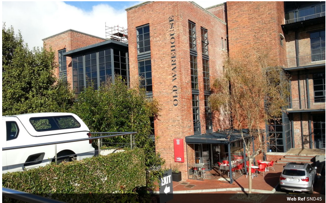
Web Ref SND45

Vineyard Centre 12 Dreyer Street Claremont Cape Town