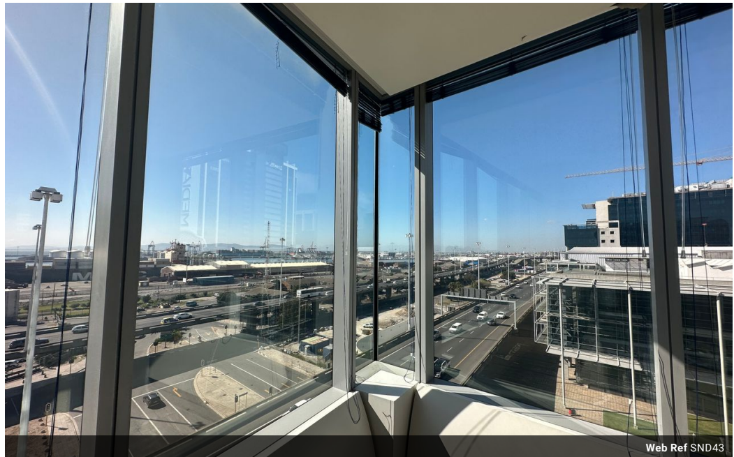
Web Ref SND43

Vineyard Centre 12 Dreyer Street Claremont Cape Town