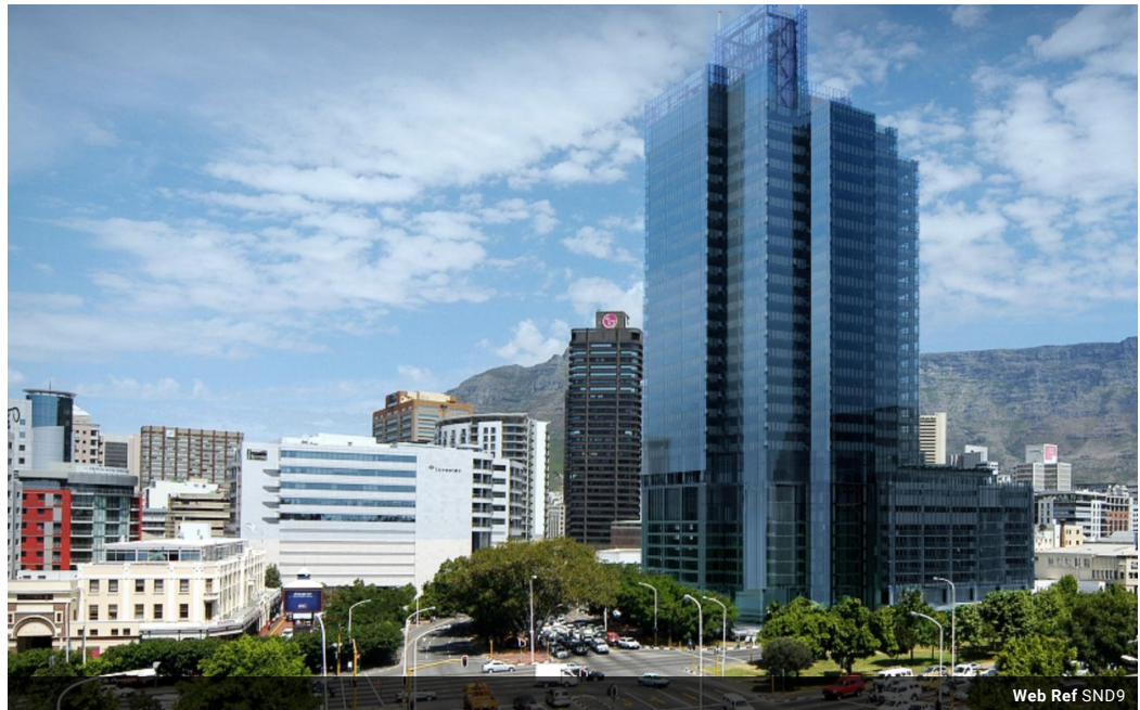
Web Ref SND9

Vineyard Centre 12 Dreyer Street Claremont Cape Town